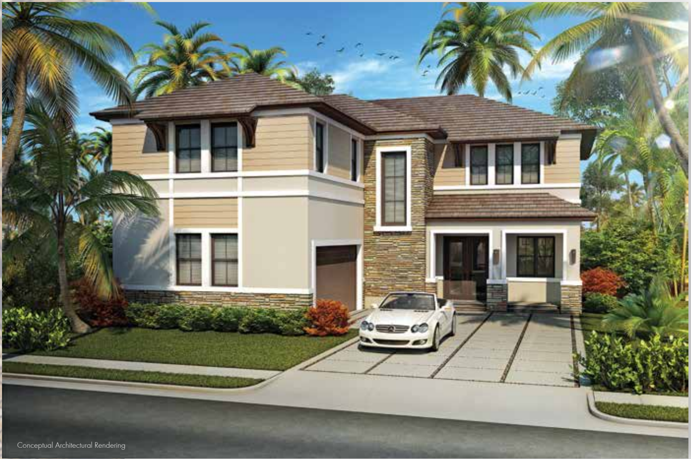
Conceptual Architectural Rendering