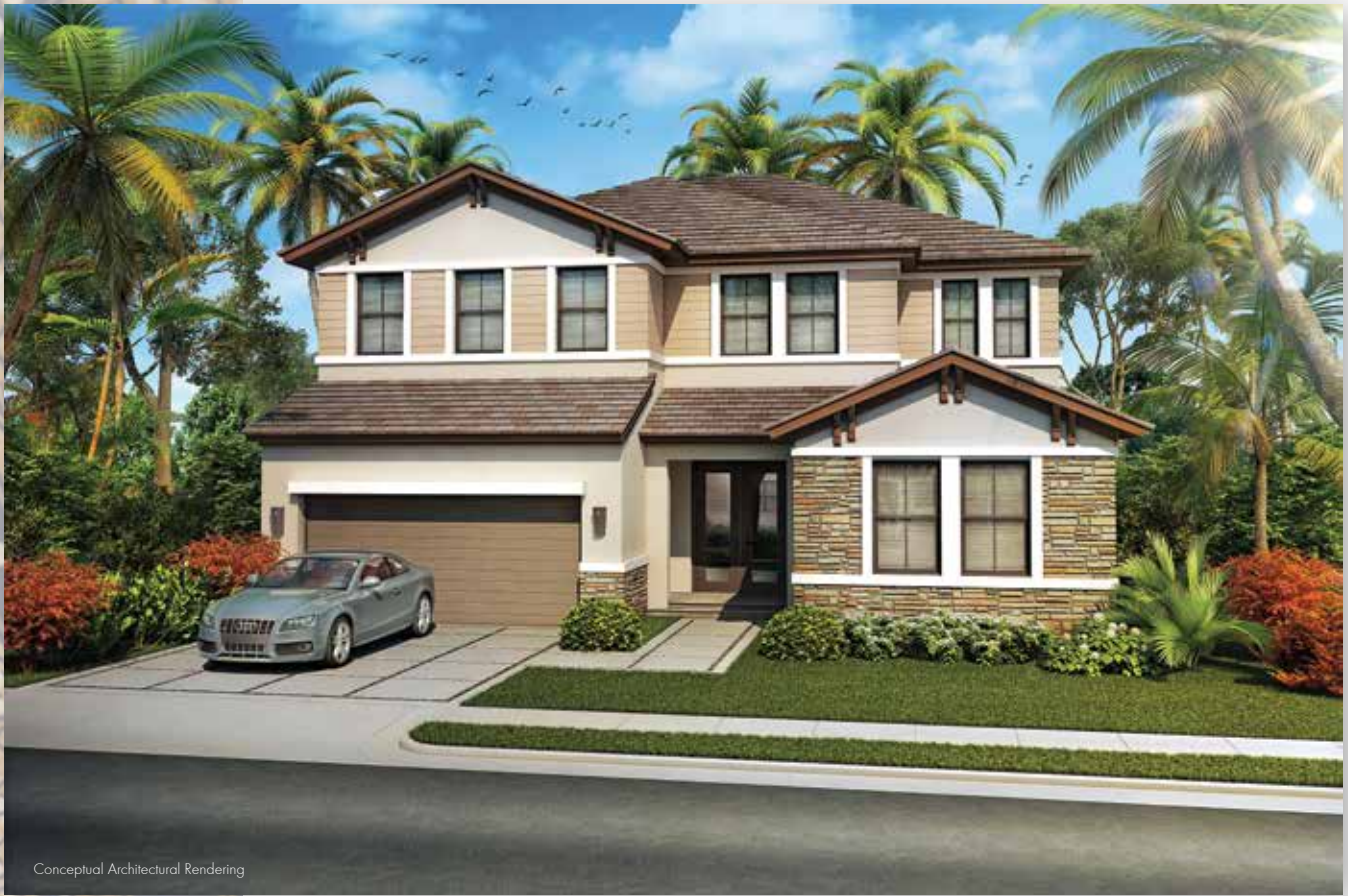
Conceptual Architectural Rendering