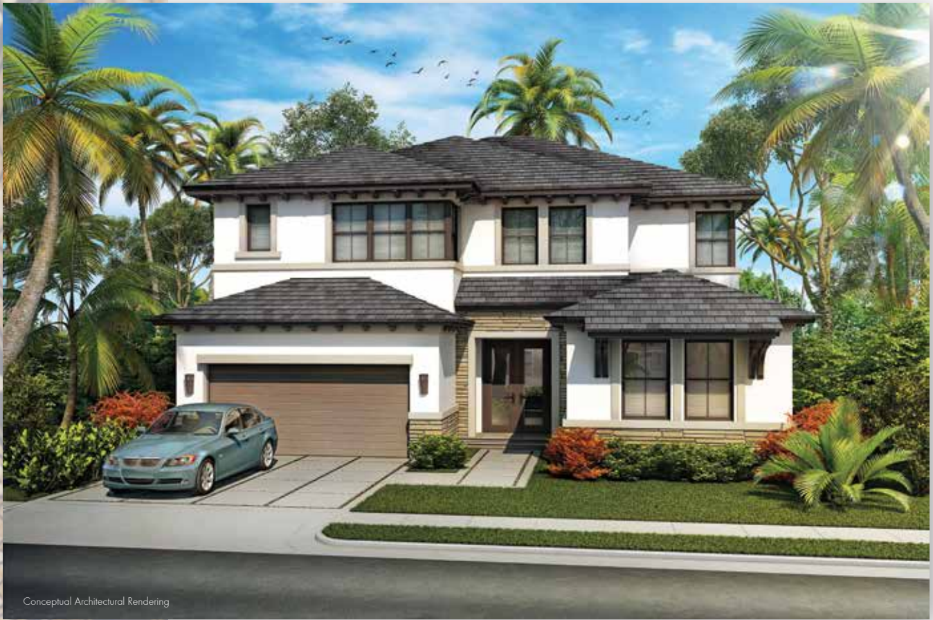
Conceptual Architectural Rendering