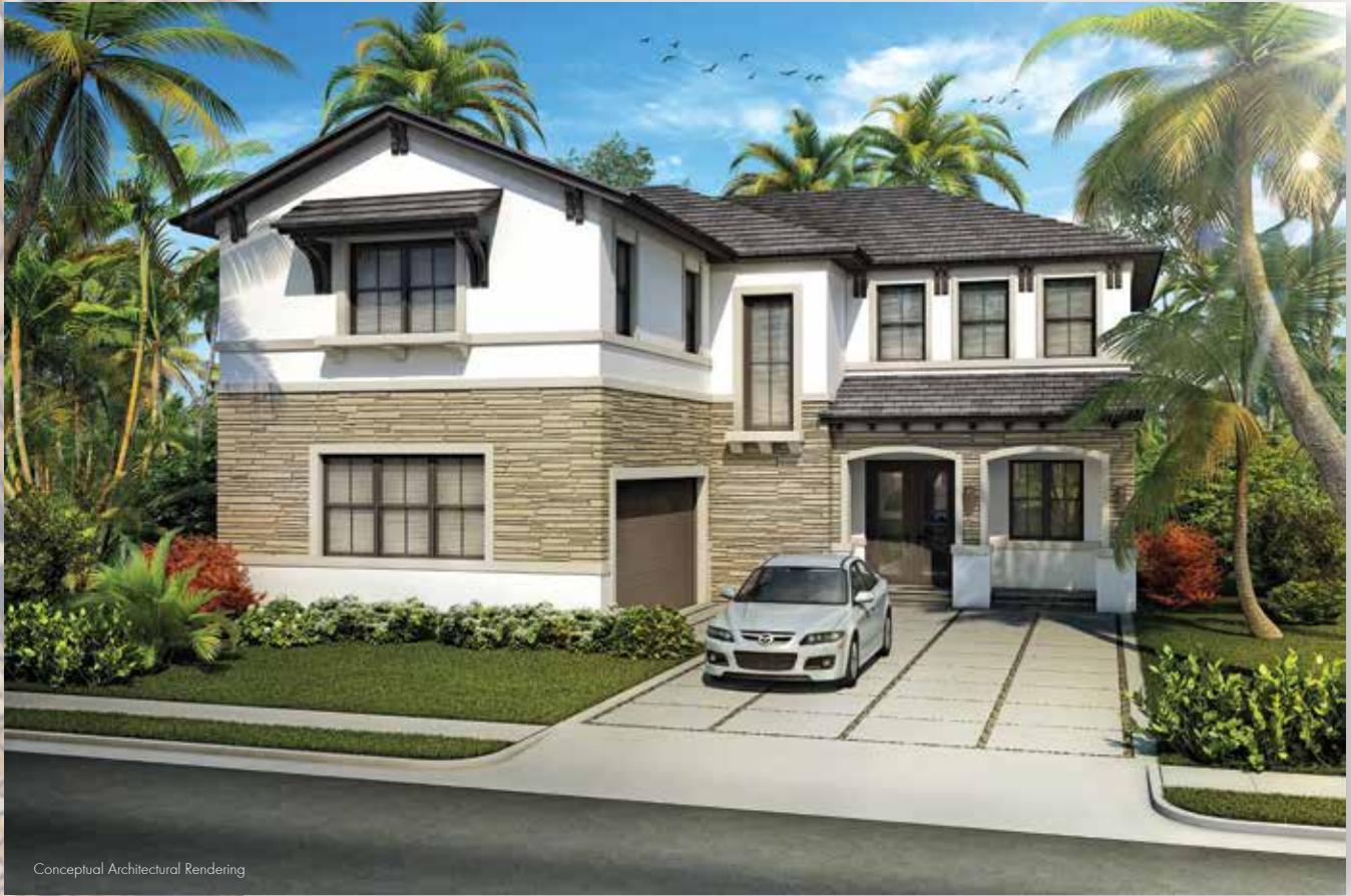
Conceptual Architectural Rendering